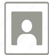
PHOTO COMING SOON