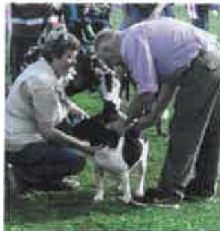
Enjoying the Fun Dog show at the Fun Day in September.

This year has been very busy for the Friends. Our two big fund raising events were a concert with the Sheringham Shantymen in the picnic area and the Catton Park Fun Day at the end of September. Both events were very popular and we were delighted to raise about £2,500. A massive thank you to all our volunteers and of course those of you who supported the events by coming along.