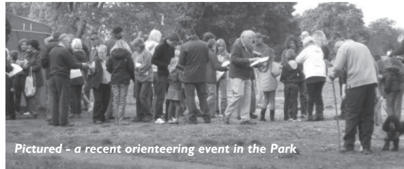
Pictured - a recent orienteering event in the Park